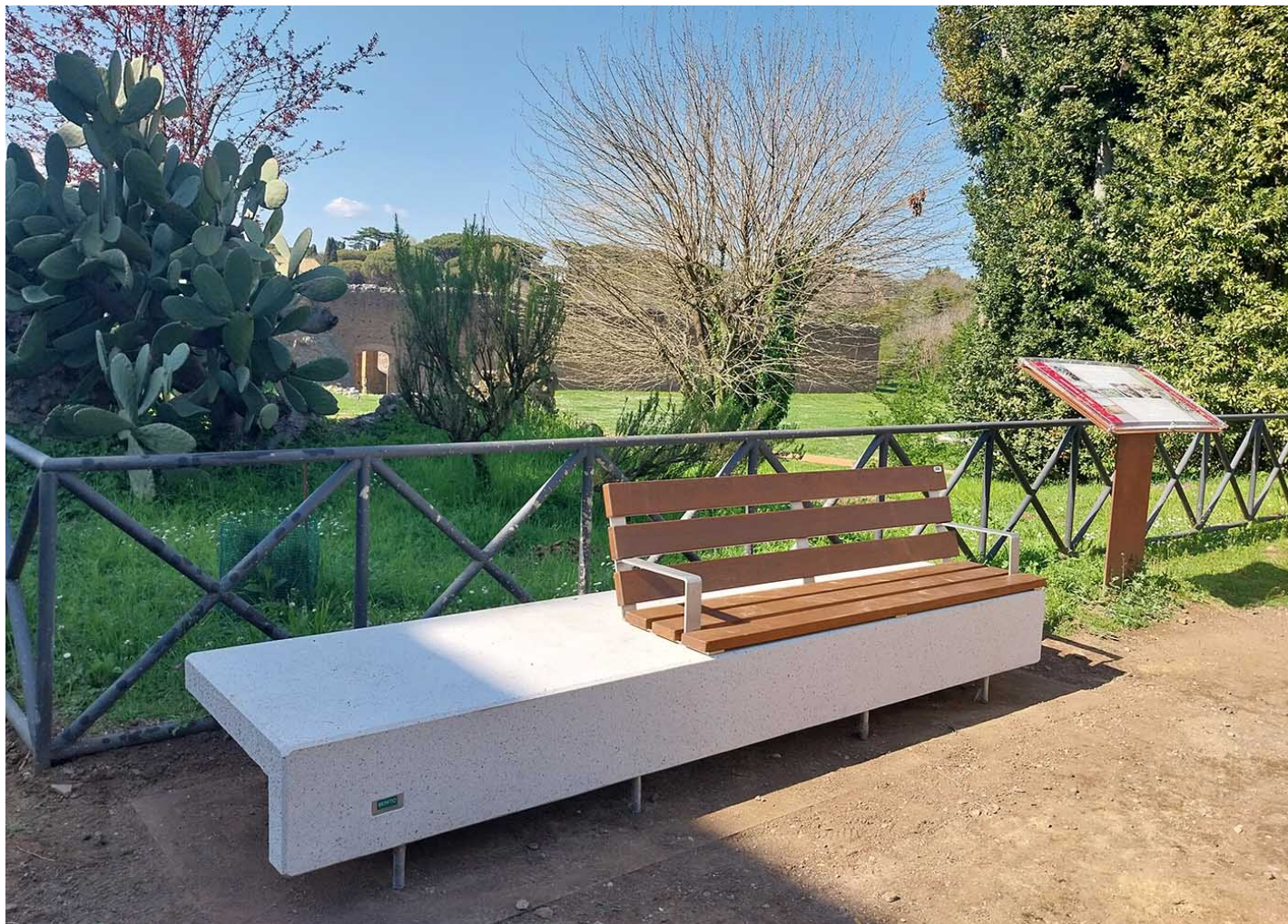
Ela Mad UM371LM

Group of ELA benches in the Villa di Massenzio in Rome. A haven of peace.