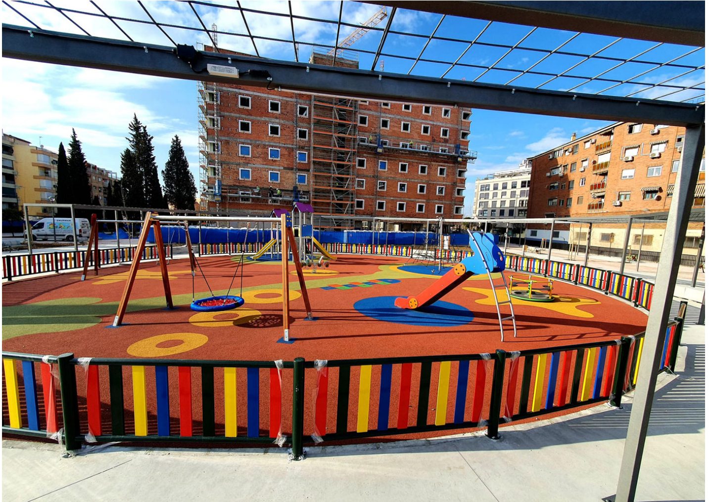
MADERA 1 Nest JL1500010

Project carried out in the Pajaritos neighbourhood including a playground and a fitness area, which has resulted in a substantial improvement for the environment.