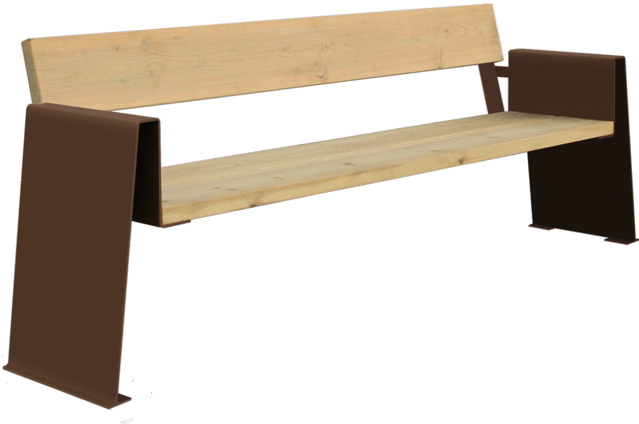
Alp ReBnew UM352PR