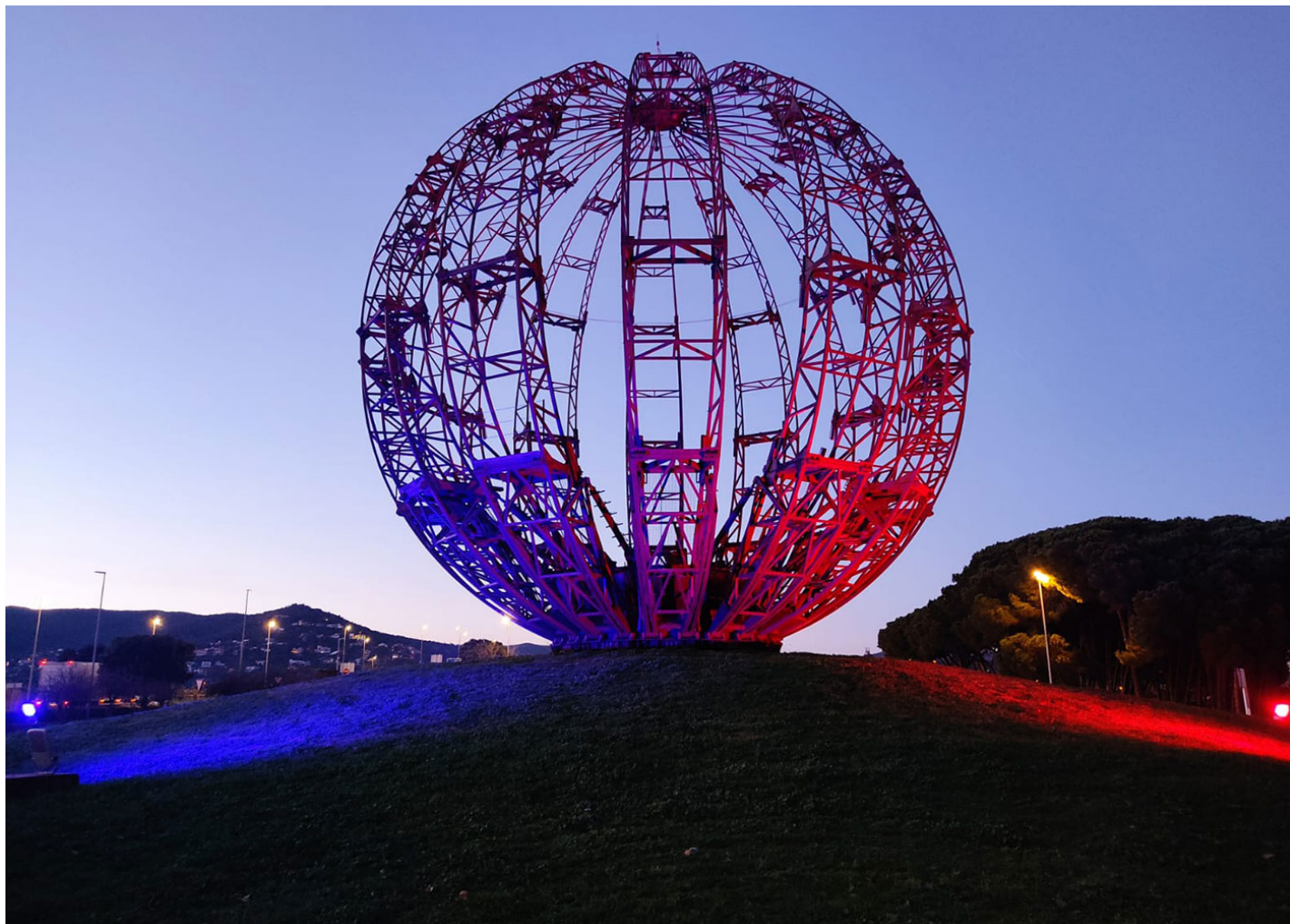
MILAN XL RGBW APMXLR

BENITO installs six RGBW projectors in the "Bola de moure el món" of Calonge to illuminate it at night.